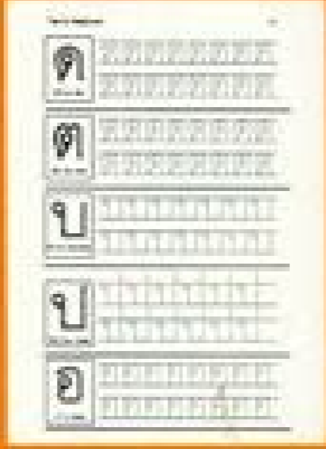
Hands on writing practice